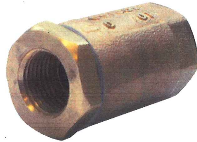
Constaflo: Sizes 1/4" to 1/2" BSPT and BSP/PL