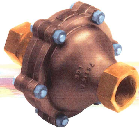
Multi Constaflo: Sizes 3/4" to 2" BSPT and BSP/PL